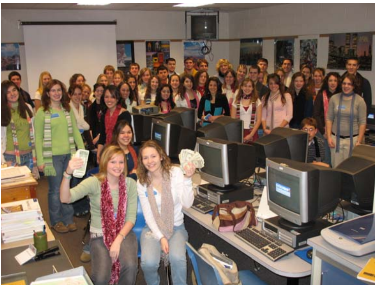
Boyertown Senior High FBLA holds second annual Scarf Day