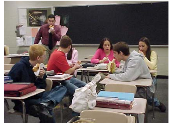
Shippensburg homeroom celebrates breakfast party

Spring edition of Penn Pal deadline: March 15, 2005