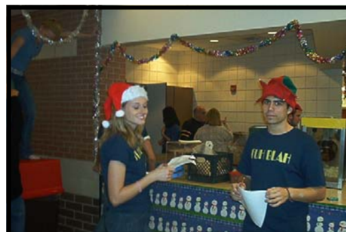
GV students getting ready for the holiday season.

Breeze through the Penn Pal — schools speak out!