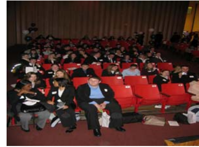
PV members at the Region 21 RLC