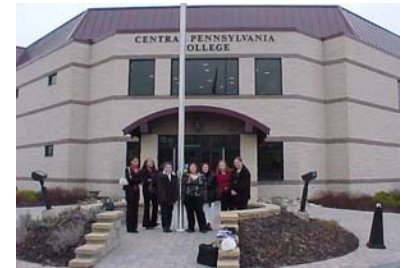
Shippensburg at Region 26 RLC