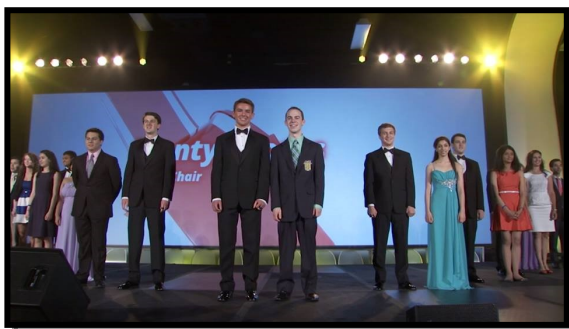
Pictured above: the 2013-2014 National Officer Team standing beside the newly elected officers at the Closing Session.