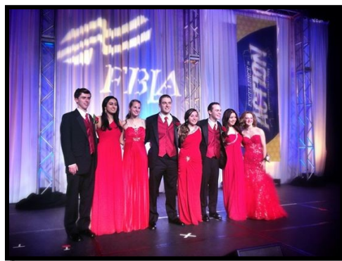
The 2013-2014 State Officer Team at the 2014 SLC Closing Session.