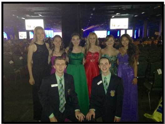
The State Officer team attending the Closing Session at the SLC (left) and the girls attending the January Executive Committee Meeting (right).

Additionally, I have grown so close to the rest of the state officer team and I hope that we all stay in touch throughout our college years. You all are kind and genuine people that I am lucky to call my friends. To all of PA FBLA: I hope that you all challenge yourselves to be the best you can be and realize that we have the capabilities to revolutionize not only the business world, but America as a whole. I want to thank you all for making FBLA the highlight of my high school career.