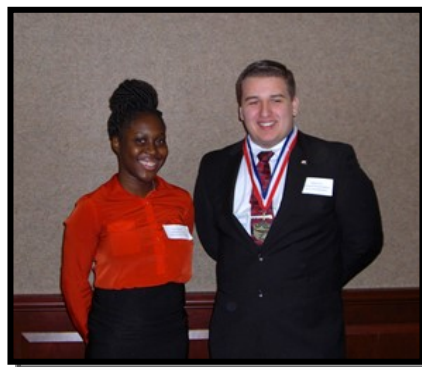
Easton Area FBLA members attend the Regional Leadership Conference at Lehigh Carbon Community College.