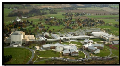
The Milton Hershey School is one of the most well-known of Hershey's philanthropic projects.