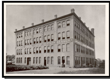
An early photo of the Lancaster Caramel Company factory, where Hershey began his success.