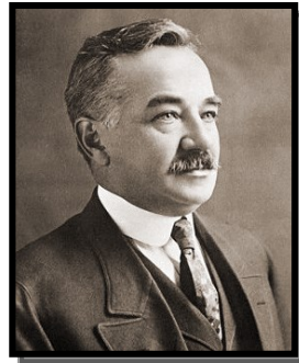
A photo of Milton S. Hershey— famous for his business success and philanthropic efforts.

A fter two attempts to begin his own company, Hershey had finally succeeded. Four years after its establishment, the Lancaster Caramel Company had become one of the leading caramel manufacturers in the world. Soon afterwards, Hershey attended the World's Columbian Exposition in Chicago in 1893. It was here that Hershey decided to expand his candy production to include his most famous product: the Hershey chocolate bar. After having his company expand rapidly, he sold his caramel company and focused entirely upon chocolate; the Hershey Chocolate Company was born.