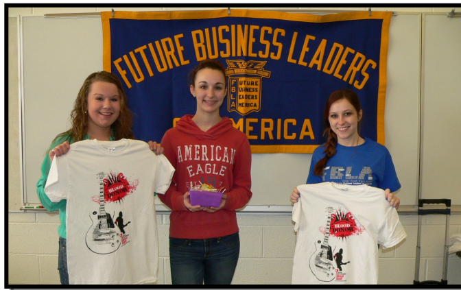
Pictured to the left are three members of the Cedar Crest Chapter of FBLA hosting the blood drive.