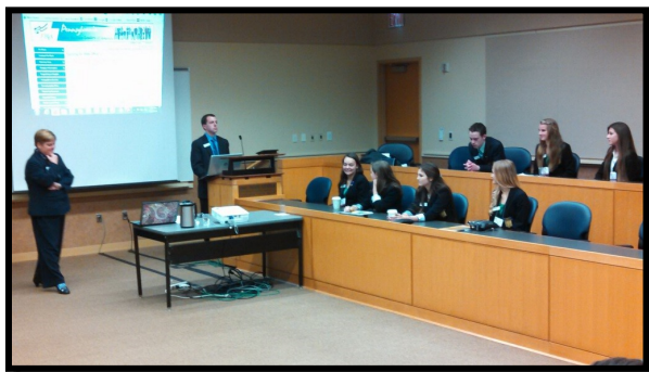
Left: A workshop is presented by the state officers on running for a state officer position.

A fter the Opening Session, members had the opportunity to attend multiple workshops presented by FBLA advisers, PA FBLA Executive Committee members, and experts in the field of business. With the plethora of workshops available, there were countless opportunities for members to improve their leadership skills and network with other members. That evening, the annual Dodgeball Tournament was held to raise additional funds for the Twilight Wish Foundation. After a long day, members retired for the night to prepare for a second day full of opportunities.