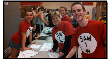
Annual Dodgeball Tournament