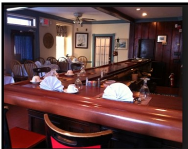
Pictured at left: the interior of the Francis Kauffman House. Pictured at right: the exterior of the Francis Kauffman House.