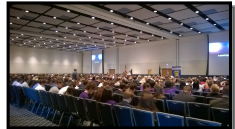
After— Closing Session, November 3