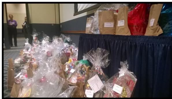
Right: Baskets donated to the Basket Auction wait to be raffled on the second day of the conference.