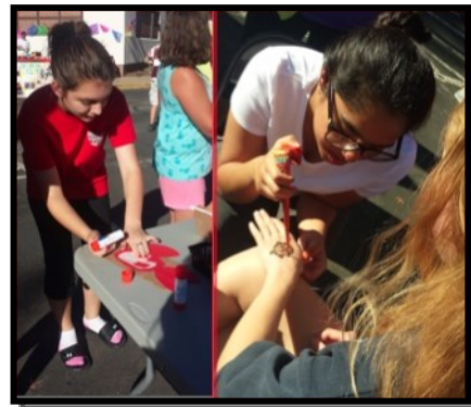
Members are pictured at left helping the children make the foxes and painting their hands.

F ox Chapel (FC) Area High School FBLA participated in the third annual Carnival, a community-wide event that kicks-off the homecoming football game and dance. Fox Chapel FBLA sold henna tattoos and had children create paper bag foxes to show their school spirit. All money raised will benefit the Twilight Wish Foundation.