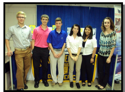
Pictured are Cedar Crest High School FBLA members participating in the Lebanon Valley Chamber of Commerce “Battle of the Businessmen.”