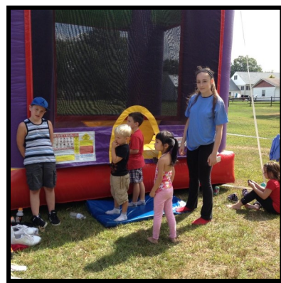
A Souderton FBLA member volunteering at the children's stations.