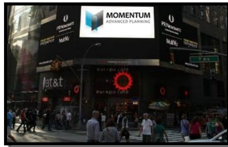
The headquarters for Momentum Advanced Planning is in Chicago, Illinois.