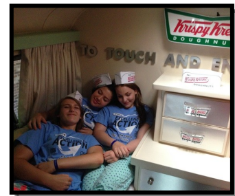
The winning photo submitted by Claysburg-Kimmel High School.