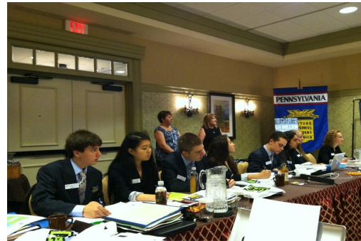
The state officer team listening to the Donate Life PA presentation.