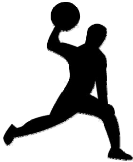
Dodge ball tournament