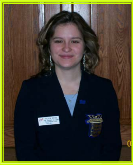
Vice President at Large

This past year has been one of the most amazing experiences of my life and the best opportunity that I have ever had a chance to experience. I have served in the offices of FBLA Local Secretary, FBLA State Vice President-At Large, and National Honor Society Vice President. I have many memories from this year, but one of my favorites is the opening session at the 2006 NLC in Nashville. It was so interesting and exciting because there was no longer schools competing against schools like at the SLC, but schools