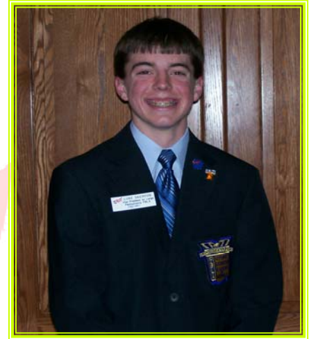
Vice President at Large

never learned or experienced. Especially in regards to this year with our executive committee meetings – those have taught me and shown me how important sleep is, because you certainly don't get a lot of it while you are there, you are so busy working that sleep gets pushed aside! Overall, FBLA has taught me things that have and will continue to impact my life, and I will benefit from these experiences for years to come.