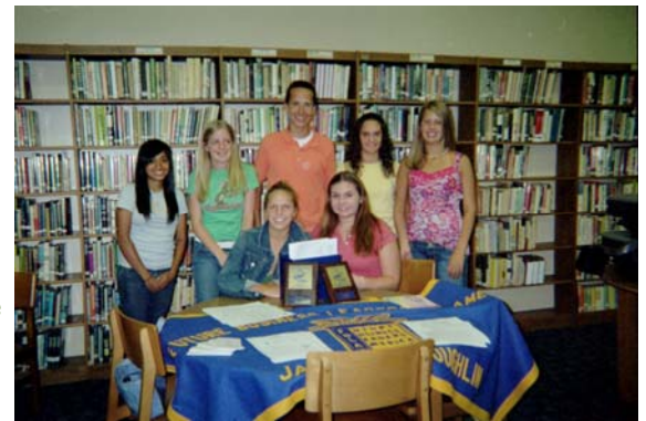
CHS FBLA Officers at Freshman Orientation

The Coughlin FBLA is having a great start so far this year. We hope to continue with our success and achieve a lot more things, and we hope all the other FBLA chapters have a great year as well. We are looking forward to future events and plan on making many accomplishments. All of the members of the FBLA are working very hard and we are sure that this year will be a great one.