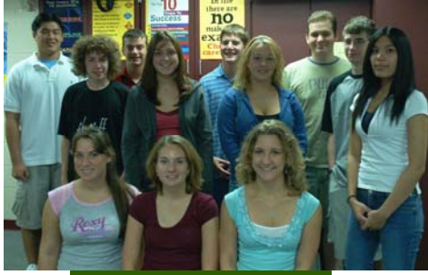
Garnet Valley Students

During the week of July 30, twelve Garnet Valley Future Business Leader of America students attended Pennsylvania Free Enterprise Week (PFEW). PFEW is a program that educates high school students about the American free enterprise system through a simulated business experience. Each student-run simulation is in competition with the others. Students had the opportunity to deal with all of the decisions that real executives would have to face. Business volunteers, who served as Company Advisors, mentored each student company. As a supplement to the simulated business, PFEW also provided students with the insight of motivational speakers.