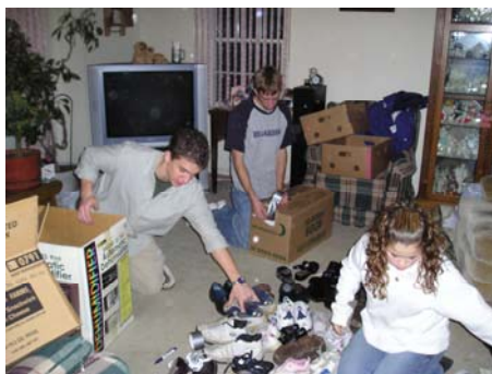
Cocalico students stuffing boxes with shoes.

stores and restaurants was amazing. We sent various