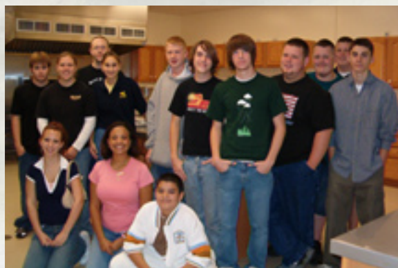
Left: Members from Cedar Crest High School FBLA share in the feeling of success from their recent membership recruitment drive, resulting in over ninety members attending their first meeting