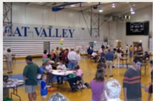
Right: FBLA takes an integral part in the Great Valley Extravaganza

FBLA members are participating in the Relief Pitchers program, an effort by the Great Valley Little League Foundation to supply baseball uniforms and equipment to disadvantaged youth. This year, the equipment will be donated to teams in the Dominican Republic. Members have also been collecting money for the March of Dimes, the National FBLA project. Great Valley FBLA has a number of activities planned for the future and should have a productive and successful year.