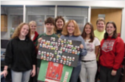
Left: Purchase Line shows off the success of their candy sale fundraiser