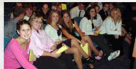
Right: Members await the start of the RLW at Northeastern.