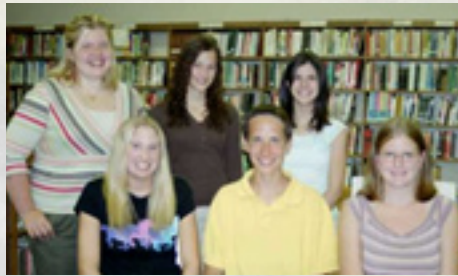
Above: Future JMC FBLA members pose at the Freshman Orientation

15th. The money from this fundraiser will help finance the club's activities, donations and future trips.