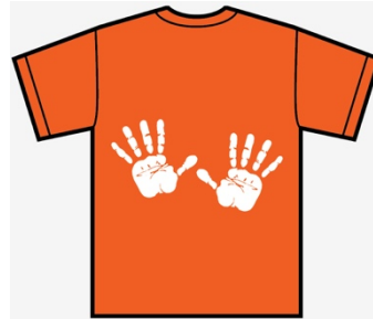
Back of T-Shirt

Note: Design is on both the front and back of an orange t-shirt.